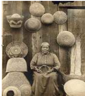
A Modoc woman with baskets made from tule and other local plants