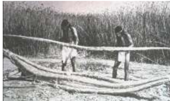
A canoe made from tule

After your experience making a duck decoy, answer the following questions: